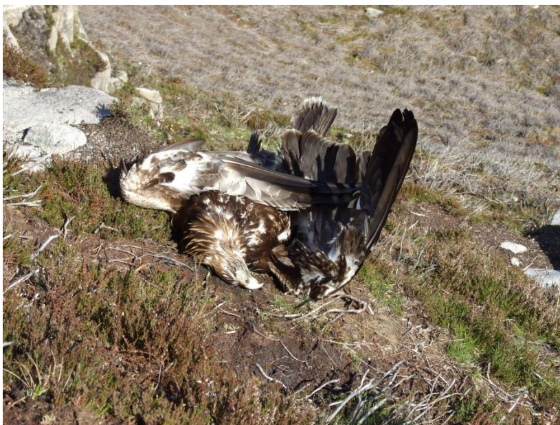
Figure 3 Poisoned Golden Eagle, Skibo, May 2010

A considerable number of peer-reviewed scientific studies have demonstrated that the abundance and range of many of the main species which are the target of wildlife crimes are hugely constrained in Scotland. Assessments of the causes of these lower abundance figures are made by using population modelling techniques, including known mortality levels. The results are often devastating. Wildlife crime is the most serious threat to many of our rare and iconic species.