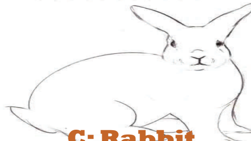
C: Rabbit Rank: