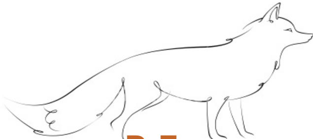
D: Fox Rank: