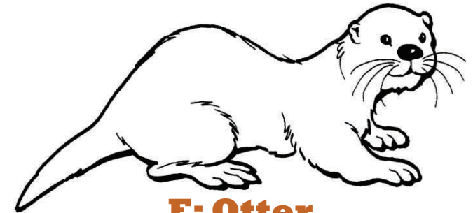
F: Otter Rank:

Check your answers: How many did you get correct?