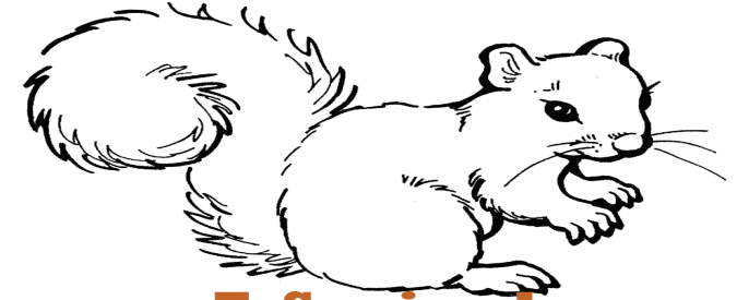
E: Squirrel Rank: