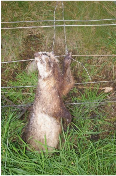
Figure 1 Captured Badger

The majority of offences in Scotland (over 50%) are reportedly linked to unlicensed sett disturbance during agricultural, forestry and development work, 6, 14, 22 although it has also been suggested 18 that badger baiting incidents are under-reported and widespread (with claims of 'about 200 incidents' being recorded between 2010-2013, but see conflicting data in Tables 1 and 2).