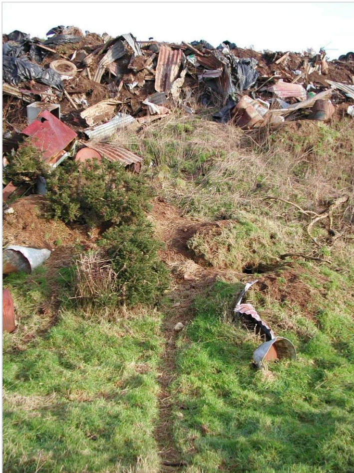
Figure 1 Rubbish dumped on a badger's sett

1.1 Wildlife crime is a serious problem in Scotland. Despite our reputation as a country at the international forefront in protecting the natural environment; a country where people love and care deeply for our spectacular, varied and beautiful wildlife and habitats, certain categories of our wildlife are regularly persecuted and killed – to the point where entire species are threatened with extinction, or left in an unsustainable state. This situation (with regard to bird of prey persecution) was described as “a national disgrace” by First Minister, Donald Dewar MSP (1998 Vane Farm speech) and it undermines our reputation as a modern country.